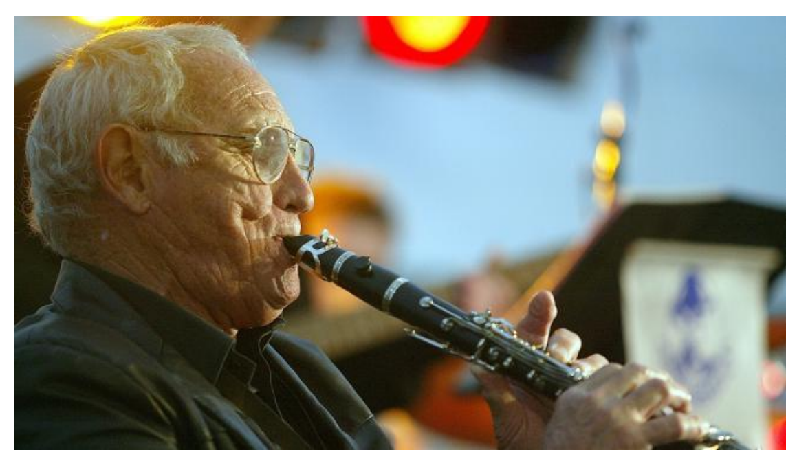
Don Burrows, pictured here in 2008, has died at 91...