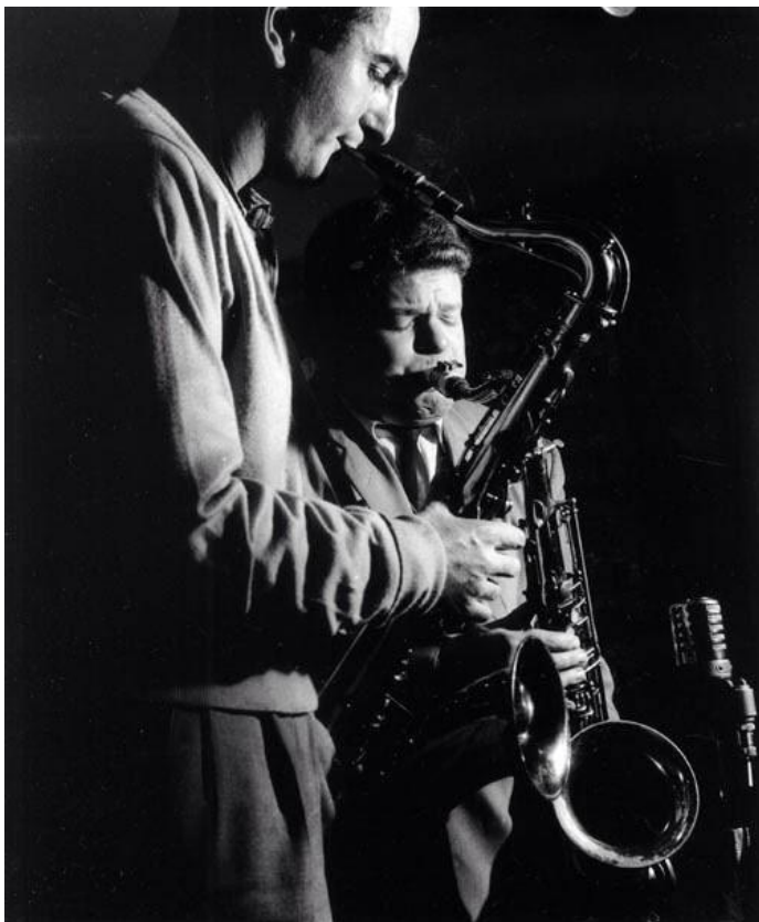
Tubby Hayes (right), pictured here with another tenorist Ronnie Scott: a sit-in with Hayes's band never happened...